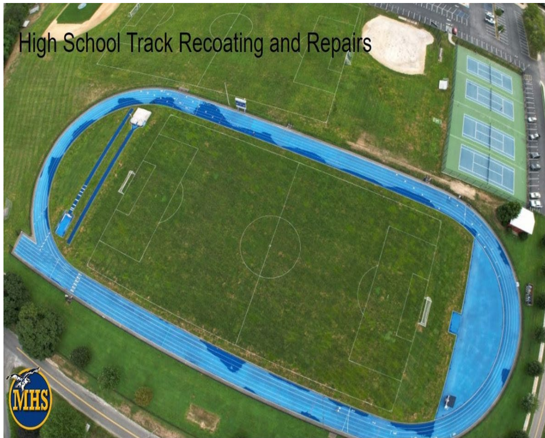
Completed newly resurfaced and restriped track at high school