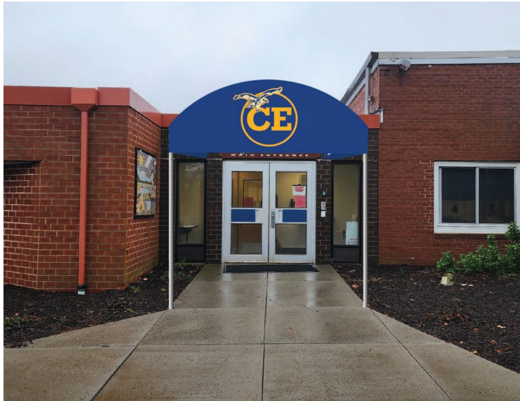
Proposed new awning at elementary school main office entrance