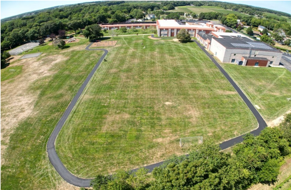
Completed new walking path at elementary school